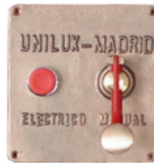
Push button panel